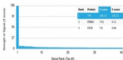
Human Protein Microarray Specificity Validation

Analysis of HuProt(TM) microarray containing more than 19,000 full-length human proteins using Tyrosinase antibody (clone TYR/3826). These results demonstrate the foremost specificity of the TYR/3826 mAb. Z- and S- score: The Z-score represents the strength of a signal that an antibody (in combination with a fluorescently-tagged anti-IgG secondary Ab) produces when binding to a particular protein on the HuProt(TM) array. Z-scores are described in units of standard deviations (SD's) above the mean value of all signals generated on that array. If the targets on the HuProt(TM) are arranged in descending order of the Z-score, the S-score is the difference (also in units of SD's) between the Z-scores. The S-score therefore represents the relative target specificity of an Ab to its intended target.