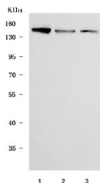
Western blot testing of human 1) 293T, 2) HeLa and 3) HepG2 cell lysate with SMC1A antibody. Predicted molecular weight ~143 kDa.