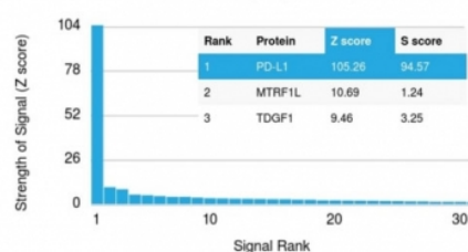
Human Protein Microarray Specificity Validation

Analysis of HuProt(TM) microarray containing more than 19,000 full-length human proteins using PDL1 antibody (clone PDL1/2741). These results demonstrate the foremost specificity of the PDL1/2741 mAb.