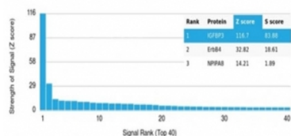
Human Protein Microarray Specificity Validation

Analysis of HuProt(TM) microarray containing more than 19,000 full-length human proteins using IGFBP3 antibody (clone IGFBP3/3517). These results demonstrate the foremost specificity of the IGFBP3/3517 mAb. Z- and S- score: The Z-score represents the strength of a signal that an antibody (in combination with a fluorescently-tagged anti-IgG secondary Ab) produces when binding to a particular protein on the HuProt(TM) array. Z-scores are described in units of standard deviations (SD's) above the mean value of all signals generated on that array. If the targets on the HuProt(TM) are arranged in descending order of the Z-score, the S-score is the difference (also in units of SD's) between the Z-scores. The S-score therefore represents the relative target specificity of an Ab to its intended target.