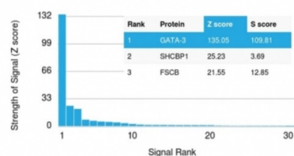
Human Protein Microarray Specificity Validated

Analysis of HuProt(TM) microarray containing more than 19,000 full-length human proteins using GATA3 antibody (clone GATA3/2445). These results demonstrate the foremost specificity of the GATA3/2445 mAb. Z- and S- score: The Z-score represents the strength of a signal that an antibody (in combination with a fluorescently-tagged anti-IgG secondary Ab) produces when binding to a particular protein on the HuProt(TM) array. Z-scores are described in units of standard deviations (SD's) above the mean value of all signals generated on that array. If the targets on the HuProt(TM) are arranged in descending order of the Z-score, the S-score is the difference (also in units of SD's) between the Z-scores. The S-score therefore represents the relative target specificity of an Ab to its intended target.