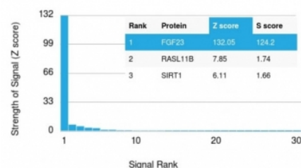
Human Protein Microarray Specificity Validation

Analysis of HuProt(TM) microarray containing more than 19,000 full-length human proteins using FGF23 antibody. These results demonstrate the foremost specificity of the FGF23/4162 mAb. Z- and S- score: The Z-score represents the strength of a signal that an antibody (in combination with a fluorescently-tagged anti-IgG secondary Ab) produces when binding to a particular protein on the HuProt(TM) array. Z-scores are described in units of standard deviations (SD's) above the mean value of all signals generated on that array. If the targets on the HuProt(TM) are arranged in descending order of the Z-score, the S-score is the difference (also in units of SD's) between the Z-scores. The S-score therefore represents the relative target specificity of an Ab to its intended target.