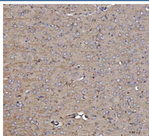
IHC staining of FFPE mouse brain tissue with Dickkopf-1 antibody. HIER: boil tissue sections in pH8 EDTA for 20 min and allow to cool before testing.