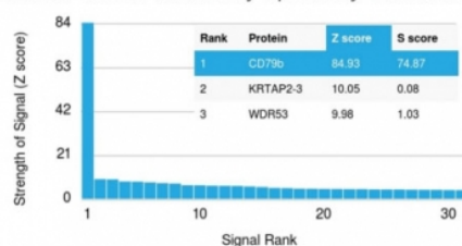
Human Protein Microarray Specificity Validation

Analysis of HuProt(TM) microarray containing more than 19,000 full-length human proteins using CD79b antibody (clone IGB/1844). These results demonstrate the foremost specificity of the IGB/1844 mAb.