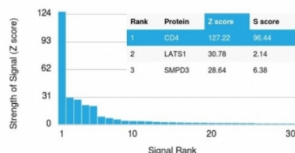
Human Protein Microarray Specificity Validation

Analysis of HuProt(TM) microarray containing more than 19,000 full-length human proteins using CD4 antibody (clone CD4/3026). These results demonstrate the foremost specificity of the CD4/3026 mAb. Z- and S- score: The Z-score represents the strength of a signal that an antibody (in combination with a fluorescently-tagged anti-IgG secondary Ab) produces when binding to a particular protein on the HuProt(TM) array. Z-scores are described in units of standard deviations (SD's) above the mean value of all signals generated on that array. If the targets on the HuProt(TM) are arranged in descending order of the Z-score, the S-score is the difference (also in units of SD's) between the Z-scores. The S-score therefore represents the relative target specificity of an Ab to its intended target.