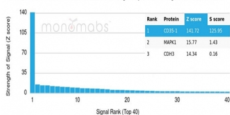
Human Protein Microarray Specificity Validation

Analysis of HuProt(TM) microarray containing more than 19,000 full-length human proteins using CD35 antibody (clone CR1/6380). These results demonstrate the foremost specificity of the CR1/6380 mAb. Z- and S- score: The Z-score represents the strength of a signal that an antibody (in combination with a fluorescently-tagged anti-IgG secondary Ab) produces when binding to a particular protein on the HuProt(TM) array. Z-scores are described in units of standard deviations (SD's) above the mean value of all signals generated on that array. If the targets on the HuProt(TM) are arranged in descending order of the Z-score, the S-score is the difference (also in units of SD's) between the Z-scores. The S-score therefore represents the relative target specificity of an Ab to its intended target.