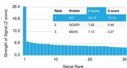
Human Protein Microarray Specificity Validation

Analysis of HuProt(TM) microarray containing more than 19,000 full-length human proteins using CD117 antibody (clone KIT/2672). These results demonstrate the foremost specificity of the KIT/2672 mAb. Z- and S- score: The Z-score represents the strength of a signal that an antibody (in combination with a fluorescently-tagged anti-IgG secondary Ab) produces when binding to a particular protein on the HuProt(TM) array. Z-scores are described in units of standard deviations (SD's) above the mean value of all signals generated on that array. If the targets on the HuProt(TM) are arranged in descending order of the Z-score, the S-score is the difference (also in units of SD's) between the Z-scores. The S-score therefore represents the relative target specificity of an Ab to its intended target.