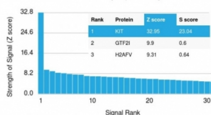
Human Protein Microarray Specificity Validation

Analysis of HuProt(TM) microarray containing more than 19,000 full-length human proteins using CD117 antibody (clone KIT/2669). These results demonstrate the foremost specificity of the KIT/2669 mAb. Z- and S- score: The Z-score represents the strength of a signal that an antibody (in combination with a fluorescently-tagged anti-IgG secondary Ab) produces when binding to a particular protein on the HuProt(TM) array. Z-scores are described in units of standard deviations (SD's) above the mean value of all signals generated on that array. If the targets on the HuProt(TM) are arranged in descending order of the Z-score, the S-score is the difference (also in units of SD's) between the Z-scores. The S-score therefore represents the relative target specificity of an Ab to its intended target.