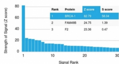
Human Protein Microarray Specificity Validation

Analysis of HuProt(TM) microarray containing more than 19,000 full-length human proteins using BRCA1 antibody (clone BRCA1/2986). These results demonstrate the foremost specificity of the BRCA1/2986 mAb. Z- and S- score: The Z-score represents the strength of a signal that an antibody (in combination with a fluorescently-tagged anti-IgG secondary Ab) produces when binding to a particular protein on the HuProt(TM) array. Z-scores are described in units of standard deviations (SD's) above the mean value of all signals generated on that array. If the targets on the HuProt(TM) are arranged in descending order of the Z-score, the S-score is the difference (also in units of SD's) between the Z-scores. The S-score therefore represents the relative target specificity of an Ab to its intended target.